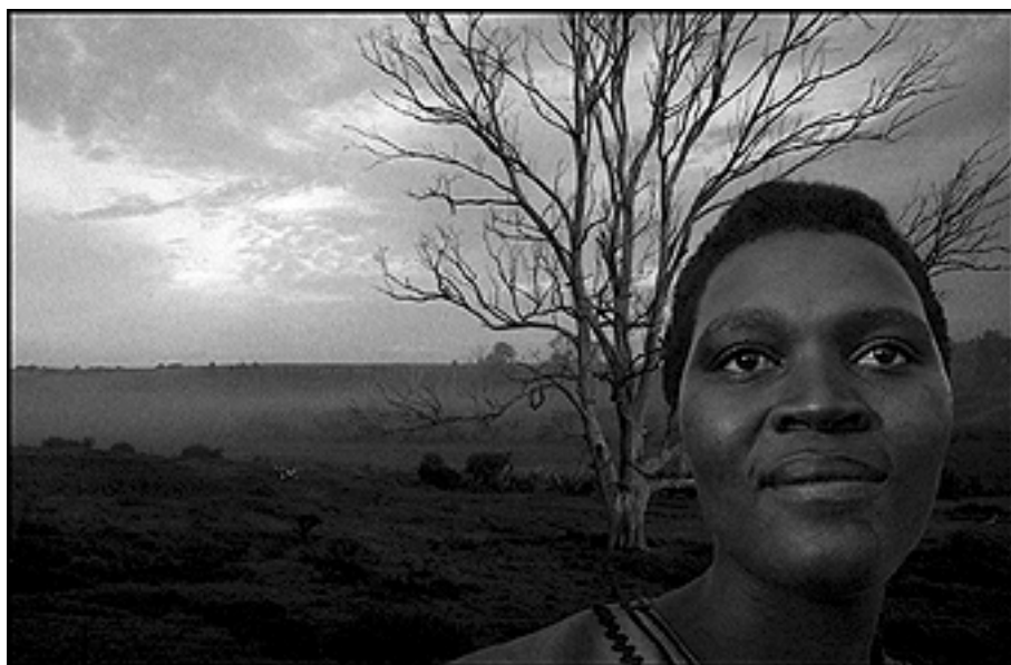
Green channel only. Pedro Meyer © 2002