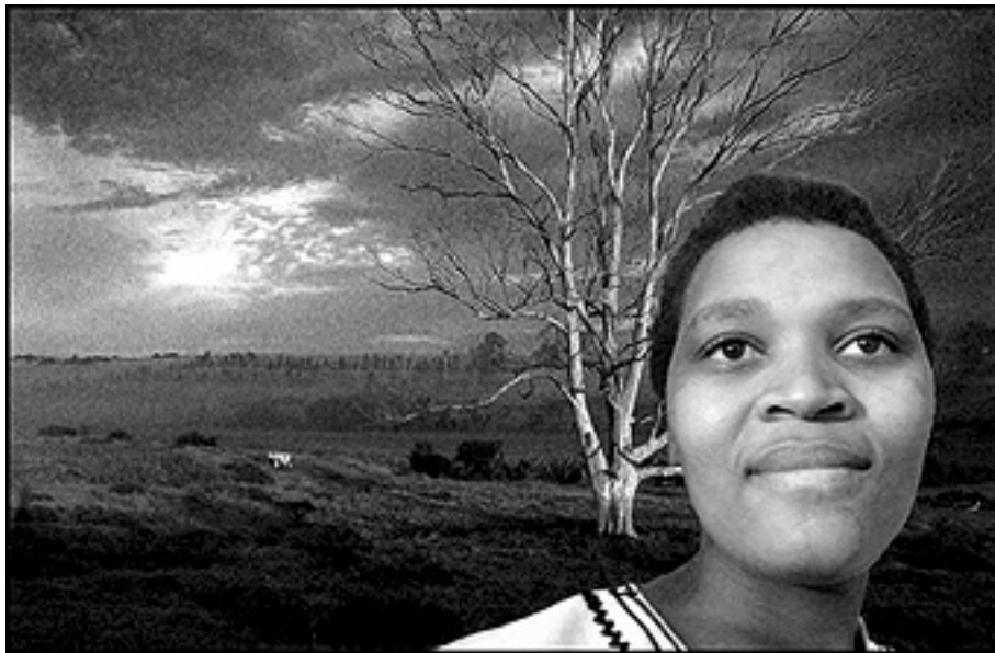
Red channel only. Pedro Meyer © 2002

Then you order your software to separate the channels (as seen below), after which you can retain the channel which represents the image closest to your personal choice. In doing so, you have to realize that you will only retain 1/3 of the pixels of the original image, thus your final file size is considerably reduced.