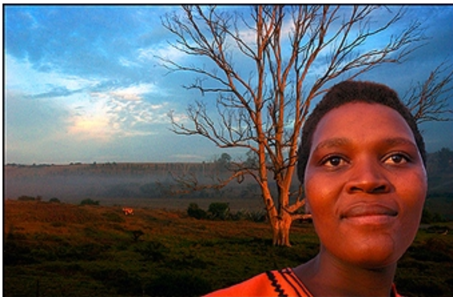
RGB file

The reason is quite simple, either in color or in B&W the camera will produce an RGB (red-green-blue) file, only that the black & white looking image is the equivalent to what you can produce with software, on your computer, when you desaturate a color file. It is important