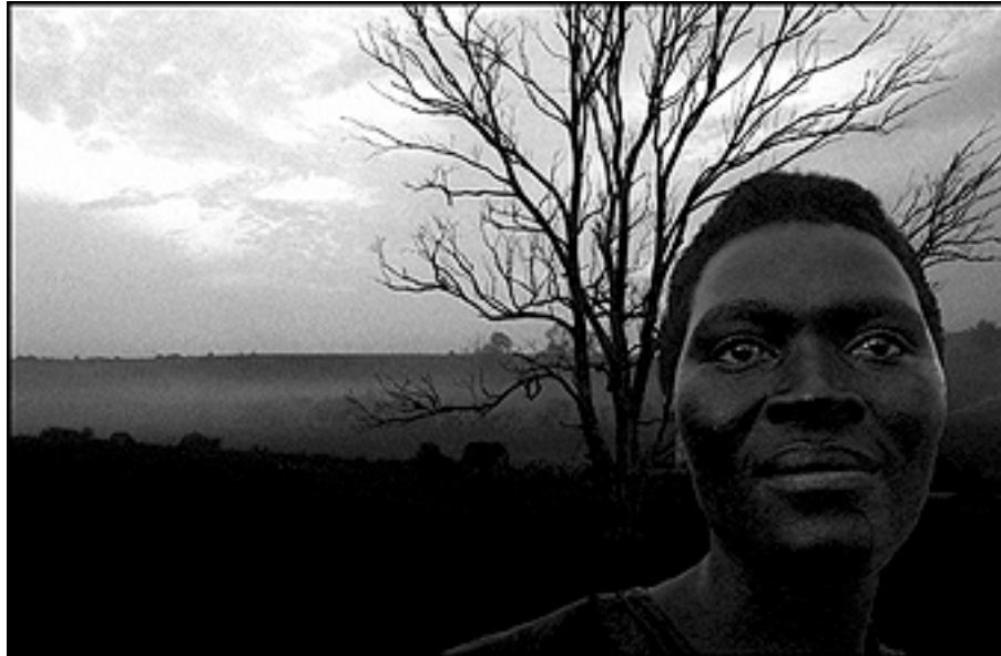
Blue channel only. Pedro Meyer © 2002

C- However, there is an even better alternative, starting with your color image, you apply a NIK black and white filter which essentially gives you the option of viewing your picture through the various color channels on a sliding scale, instead of the fixed alternatives when the channels are split.