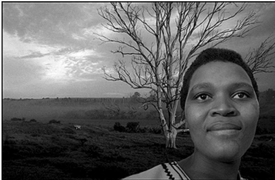
Gray scale image Pedro Meyer © 2002

A- If you take the color picture above, and transform it into a gray scale image with your favorite software, you will get the image below. You can also desaturate it, and arrive at the same looking image.