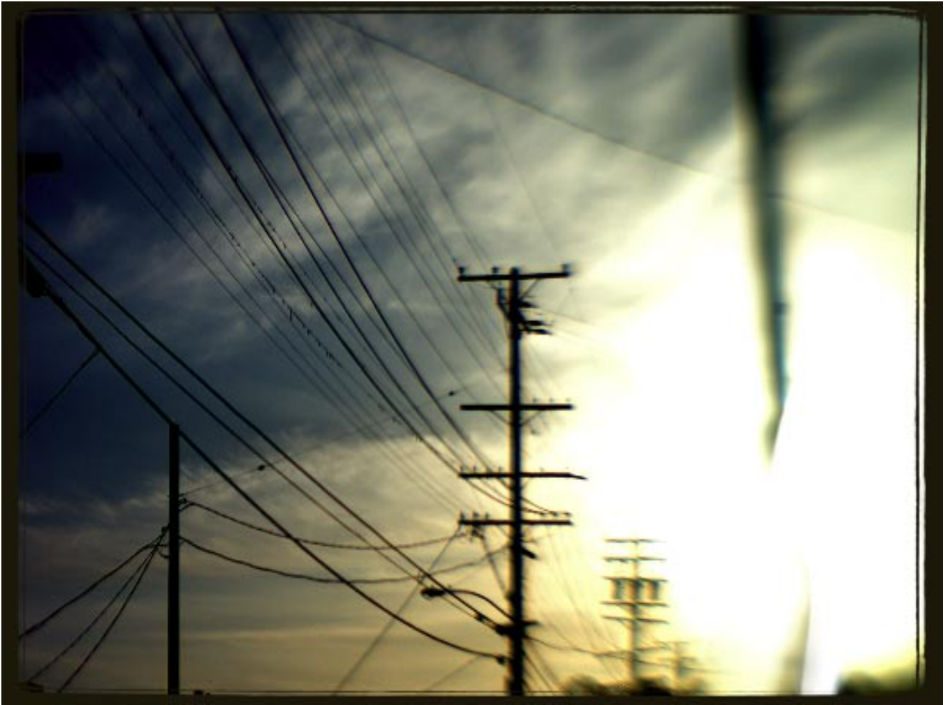
Tornado Pedro Meyer © 2004